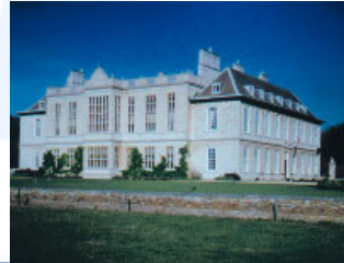
Stapleford Park Melton Mowbray

We offer a broad range of services to cater for unique business events including themed events, incentive packages and team building activities.