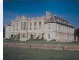
Stapleford Park Melton Mowbray

We offer a broad range of services to cater for unique business events including themed events, incentive packages and team building activities.