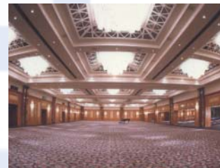
Royal Lancaster Hotel London

Another FREE service ensuring that all delegate needs are catered for using our efficient centralised booking system.